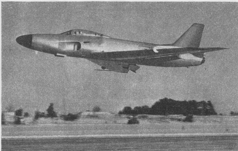
A Saab-32 "Lansen" taking off